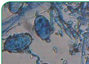
Powdery mildew hypha hyperparasitised by Ampelomyces quisqualis . Infection hyphae (stained blue) can be seen growing inside the larger hypha of Podosphaera aphanis .

Ampelomyces quisqualis is a hyper parasite of a wide range of powdery mildew fungi which penetrate the hyphal wall of a host cell and grows inside causing degradation of the cytoplasm. The rate of development within the host can be slow (5-7 days), so multiple applications of AQ10 ® are recommended to generate multiple infection points on the developing pathogen colony. The hyper parasitic activity leads to the collapse of hyphal strands and death. In order to demonstrate the effects of Ampelomyces quisqualis against powdery mildew ( Podosphaera aphanis ), pre-infected detached strawberry leaves (cv. Elsanta) were sprayed with AQ10 ® or water (control). The leaves were collected from a commercial glasshouse strawberry crop in early April at first signs of the powdery mildew outbreak which ensured that colonies were fresh and actively growing. In the AQ10 ® treated leaves, microscopic assessments identified areas of mycelium which had completely collapsed and these areas were completely devoid of conidia.